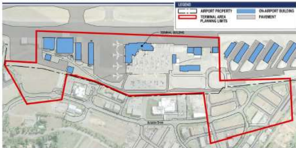
Figure 1: SUN Terminal Area Planning Limits