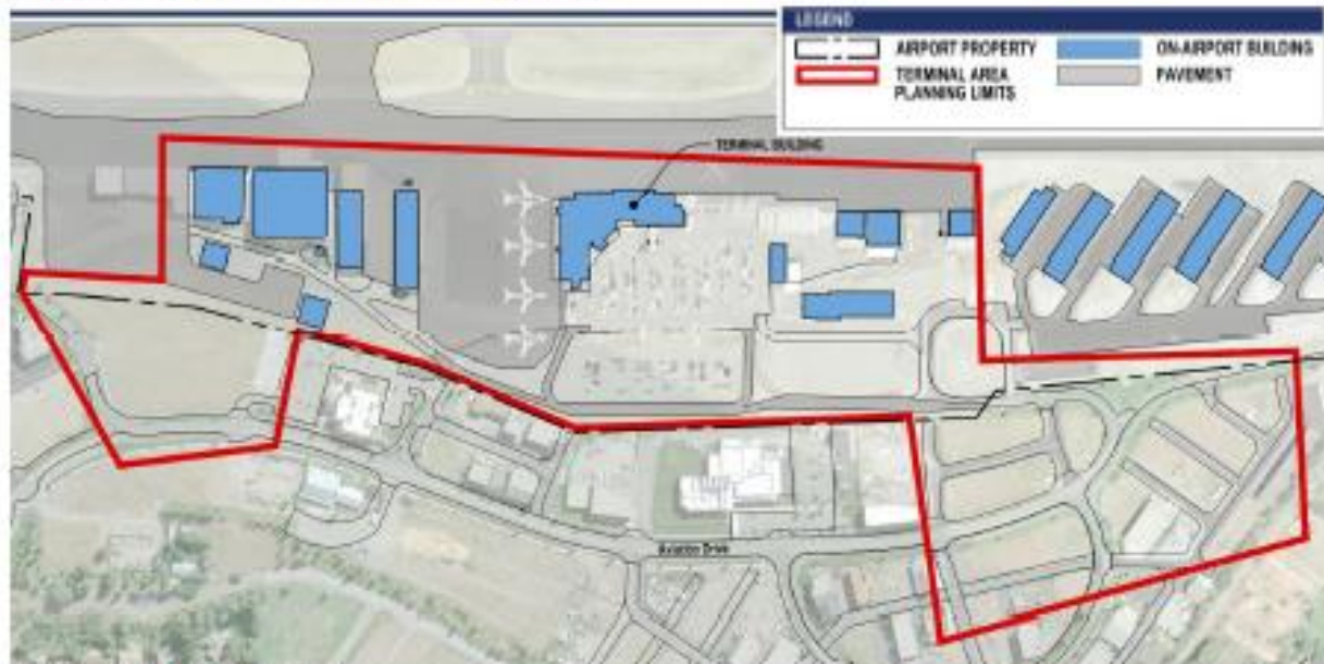
Figure 1: SUN Terminal Area Planning Limits