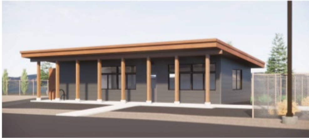
PERSPECTIVE FROM NORTHEAST