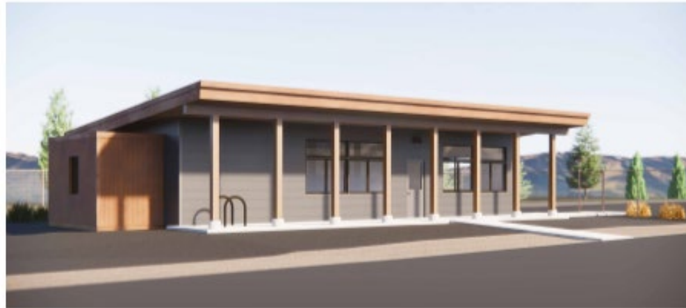
PERSPECTIVE FROM SOUTHEAST