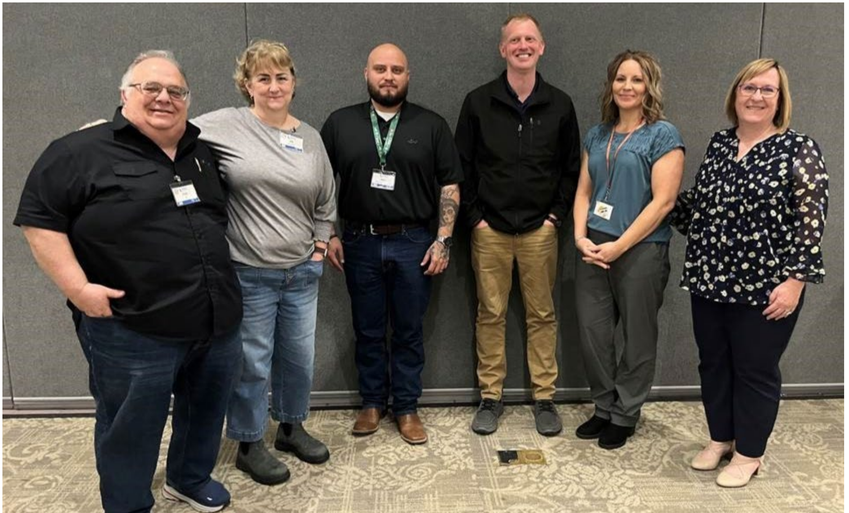
From left: SUN, BOI, TWF, IDA, PIH, Security Consultant